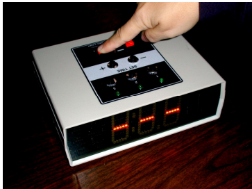
A. Press and hold RESET button

The following pictures show which buttons to press to put your Timer300 into Program Mode.