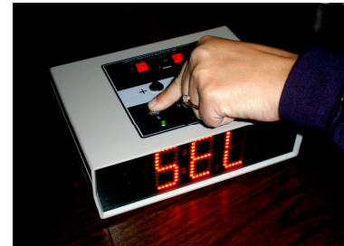
C. Continue pressing timer-3, then release RESET button. The display will show SEL to signify "Mode Select".

D. Release the timer-3 button. The programmed operating mode is shown on the display.