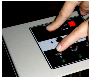
B. While pressing RESET, press and hold timer-3 button