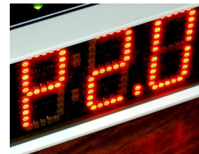
P = "pause mode"

The Timer300's display shows the mode and version when power is connected to timer.